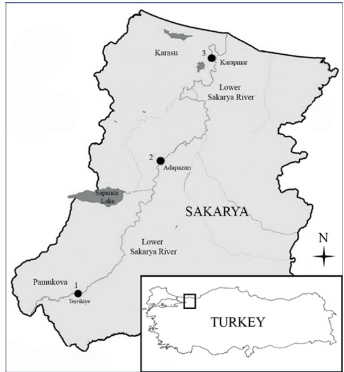
Figure 1. Study area.

A total of 1935 fish samples were collected in this study. 13 fish species belonging to five families, Cyprinidae (78.86%), Siluridae (10.96%), Percidae (5.53%), Centrarchidae (2.38%) and Esocidae (2.27%), were examined. Estimation for b value of the length-weight relationship ranged between 2.87 ( C. gibelio ) and 3.41 ( A. escherichii ). The growth type of A. brama , A. escherichii , Barbus