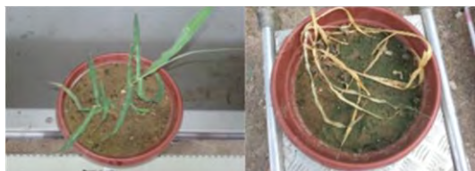
Fig. 4: Johnson Grass before and after microwave application