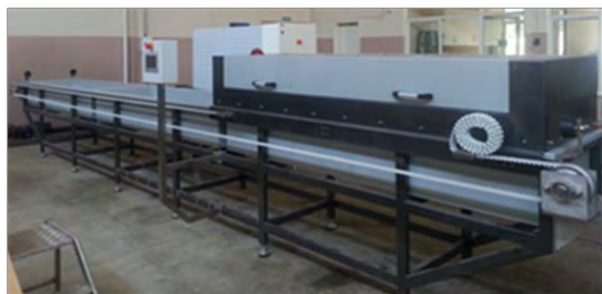
Fig. 1: A view of the prototype microwave oven in the laboratory