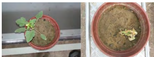
Fig. 6: Cocklebur before and after microwave application