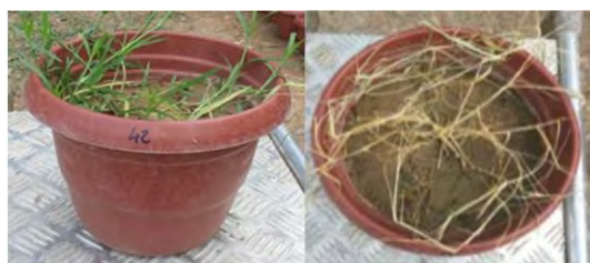
Fig. 5: Bermuda grass before and after microwave application