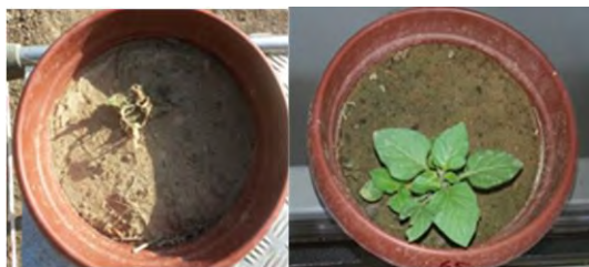
Fig. 3: Black nightshade before and after microwave application