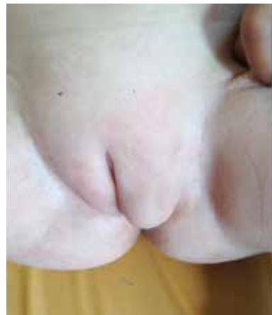
Figure 1. Female external genitalia and prolapse of the left labium majus due to the presence of a gonad (patient 2)

Patient 5 was a 15-year-old and was admitted to the clinic with complaints of primary amenorrhea and masses in the inguinal region. She was 163 cm (0.24 SDS) tall and weighed 54.1 kg (0.3 SDS). Gonads were palpable bilaterally in the inguinal region. Breast development was at stage 1 and pubic hair growth was at stage 4 according to Tanner's classification. Laboratory results were as follows: FSH 4.59 IU/L, LH 2.89 IU/L, T 1740 pg/mL, DHT 35 pg/mL, and the T/DHT ratio was 49.7.