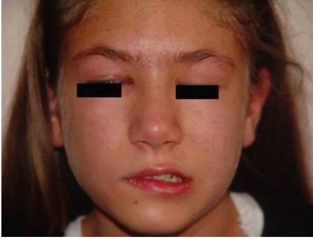
FIGURE 1: Grade 4 peripheral facial paralysis on the right.

recommended to protect the cornea. Facial electromyography (EMG) was not required, as the patient's clinical picture improved by day 21. Cranial imaging was also not required, as the patient had no history of peripheral facial paralysis and no neurological manifestations.