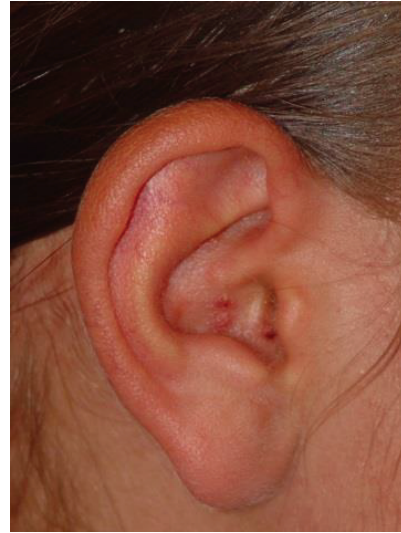
FIGURE 2: Crusted herpetic vesicles on the right ear pinna.

Starting steroids and antiviral agents in the early phase of the disease is recommended. Antivirals prevent VZV replication and facial nerve involvement, and the steroids prevent inflammation and edema. Murakami et al. examined the recovery of facial nerve function after starting treatment in the first 3 days, at 3–7 days, or later than 7 days and found