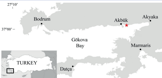
Figure 1. Sampling location of the maximum size Siganus rivulatus from Gökova Bay, southern Aegean Sea.

was collected by trammel net by a fisherman thus ethic committee approval was not required for the study. The biggest individual of S. rivulatus was caught off Akbük Bight (37°01.851'N, 028°08.669'E) (Gökova Bay) (Figure 1) at 15 m depth with trammel nets. The Total length of the specimen was subsequently measured to the nearest mm and weighted to the nearest g, where total length is expressed as the projection length between the front end of the fish head and the end point of the longest ray of the caudal fin when the mouth is closed in commercial fishery regulations of Turkey (communique no: 2016/35). Age estimation was based on otolith examination and supported with scale readings. Sagittal otoliths were removed and prepared for age readings by profiling, rubbing, and polishing. They were embedded in polyester molds and sections were obtained by cutting the mold with an IsoMet Low Speed Saw. Then, otoliths sections were polished with sandpaper (types 400, 800, and 1200) and with 3, 1, and 1/4 \mu particulate alumina respectively (Metin & Kinacigil, 2001). Age determination was carried out by a stereoscopic microscope under reflected light against a black background. Opaque and transparent rings were counted: 1 opaque zone, together with 1 transparent zone, was considered as the annual growth indicator.