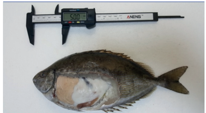
Figure 2. The maximum sized Siganus rivulatus and fat accumulation.

The concept of maximum length is generally linked to overfishing. Individuals which are exposed to high fishing pressure will respond by reproducing at smaller sizes. This mechanism results in reducing the maximum size of the species. Furthermore, feeding habits of the species, prey-predator relationships and parameters such as nutrient availability, oxygen, salinity, temperature and pollution have serious effects on growth (Helfman et al.,